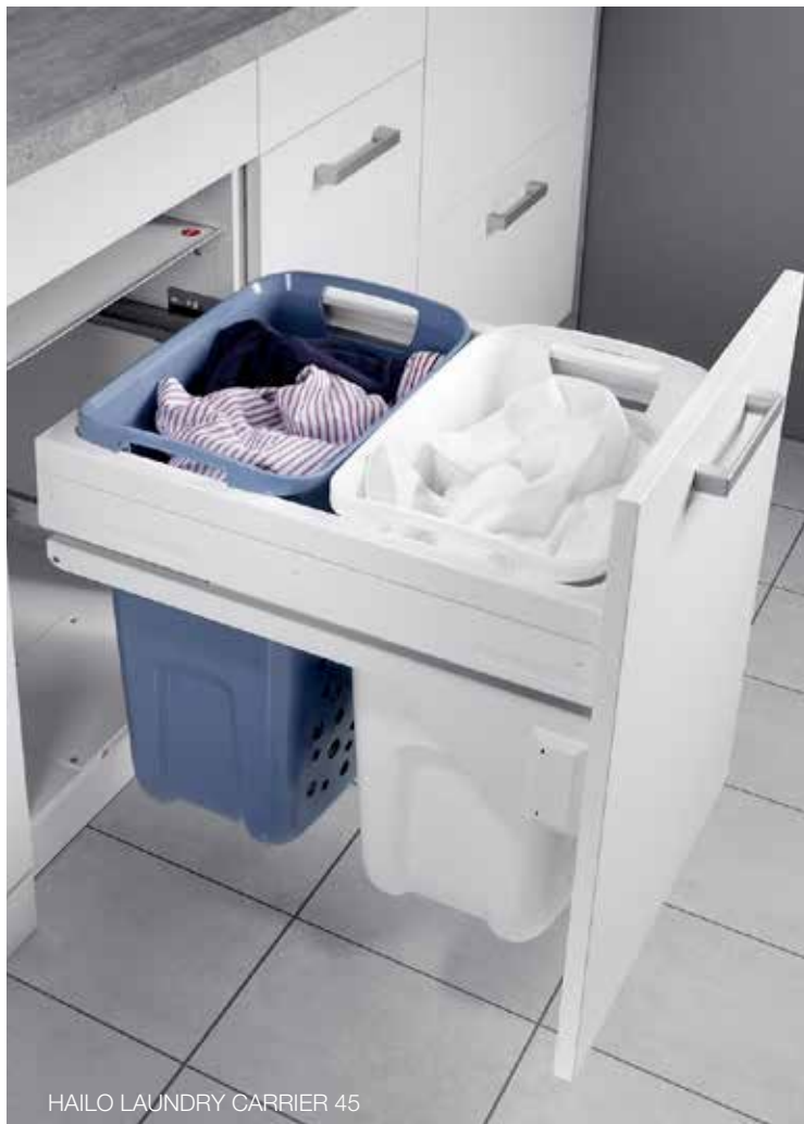
HAILO LAUNDRY CARRIER 45