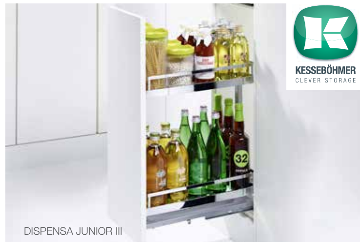
DISPENSA JUNIOR III