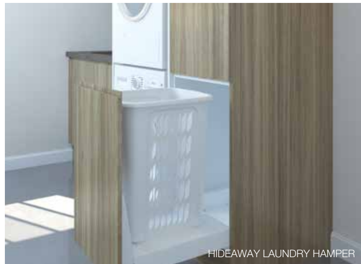
HIDEAWAY LAUNDRY HAMPER