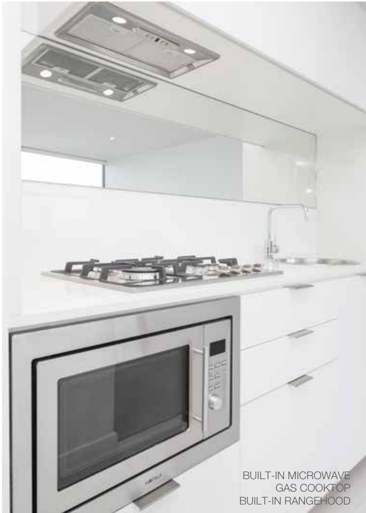
BUILT-IN MICROWAVE GAS COOKTOP BUILT-IN RANGEHOOD