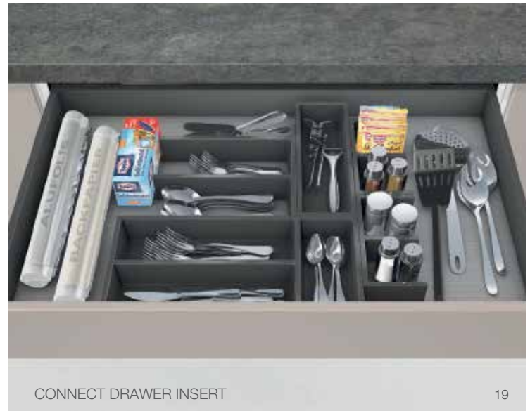
CONNECT DRAWER INSERT

Häfele's drawer inserts and accessories are suited for use in all popular drawer sizes and styles. Spice containers, cutlery inserts, internal drawer fronts, side elements and hanging waste bins are just some of the solutions on offer.