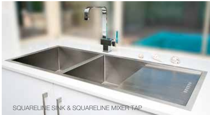
SQUARELINE SINK & SQUARELINE MIXER TAP

Tapware is a significant part of the Squareline sink range and 9 new designer taps have been added, increasing the offer to 18 taps. Some are fixed mixer taps, while others have pull-out vegi and designer spray heads and 3 complete stainless steel taps round out the collection, enabling a variety of choice to suit your needs.