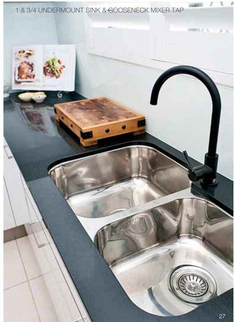
1 & 3/4 UNDERMOUNT SINK & GOOSENECK MIXER TAP