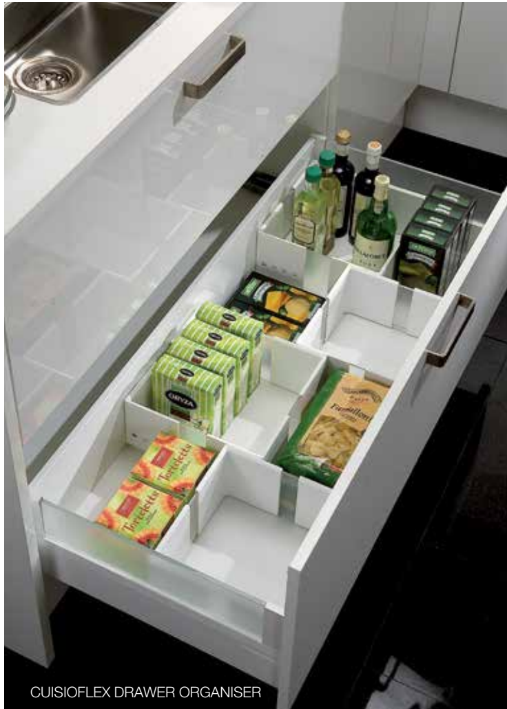
CUISIOFLEX DRAWER ORGANISER